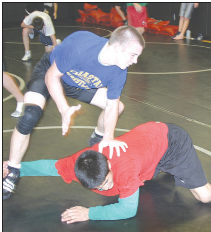
Special to Bluffton Today

"I feel good going into this season. It's going to be tough wrestling at 152, but it's something I'm