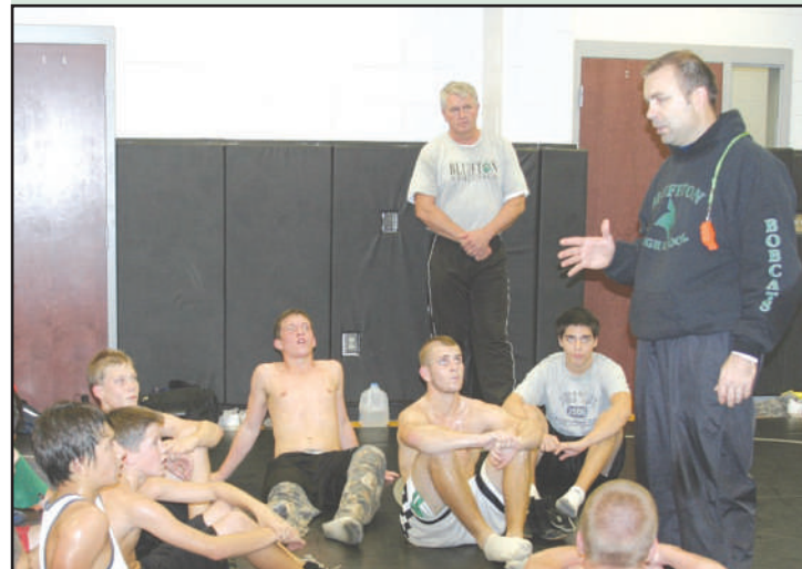
Special to Bluffton Today